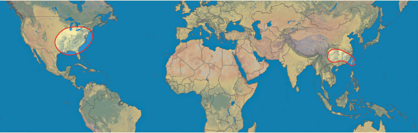
Native ranges of Sassafras species in eastern North America and eastern Asia.