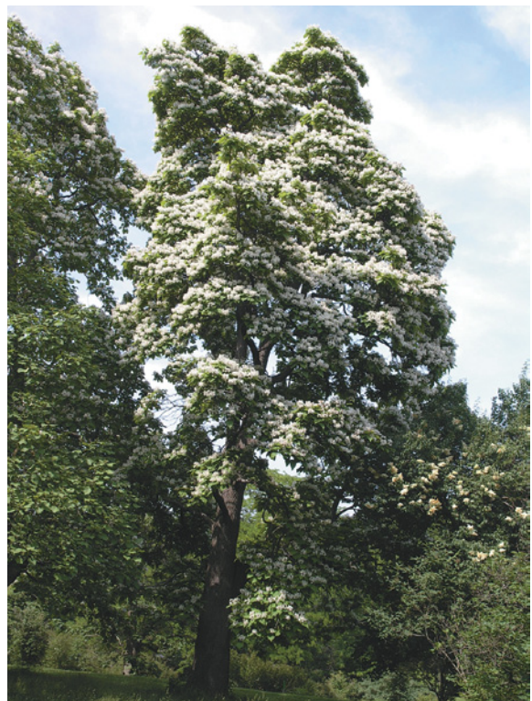
Manchurian catalpa ( Catalpa bungei ), left, is native to China, while northern catalpa ( Catalpa speciosa ), right, is native to the central and eastern United States and southern Ontario.