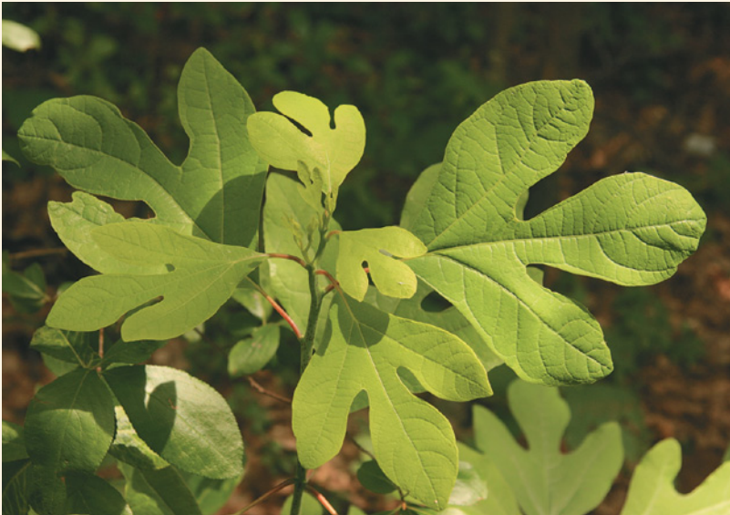
Foliage of Sassafras albidum (left), a familiar native tree in much of the eastern United States, and of S. tzumu (right), native to China.