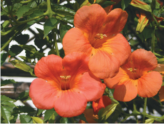
Showy flowers are a feature shared by Chinese trumpet creeper ( Campsis grandiflora ), left, and the familiar trumpet creeper ( Campsis radicans ) of North America, right.