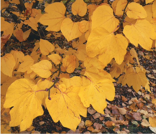
Lindera obtusiloba (seen here in fall color at the Arnold Arboretum) is one of the many Lindera species native to eastern Asia.

the abundance of varied habitats and natural barriers that could allow different populations of a species to evolve separately (Sargent 1913; Qian and Ricklefs 2000). The EA–ENA disjunction is now recognized not only among plants, but among taxa of fungi, arachnids, millipedes, insects, and freshwater fish, as well (Wen 1999). But botanists can take credit for being the first to notice and document the phenomenon.