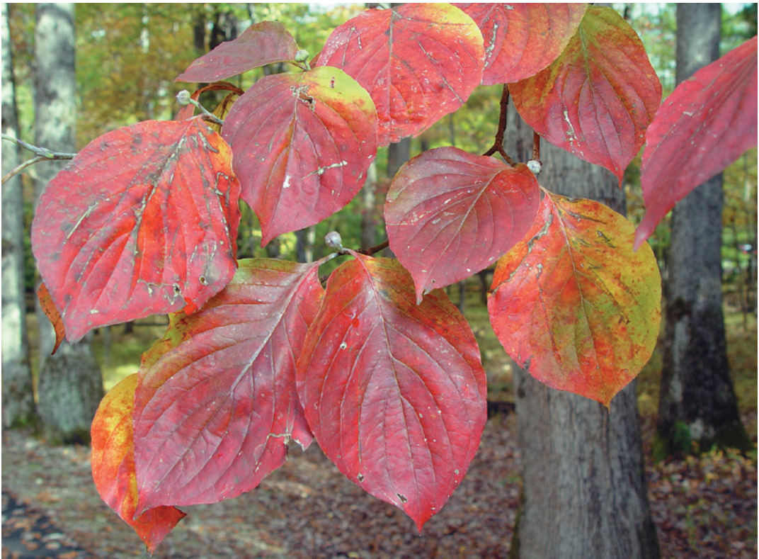
Autumn foliage of kousa dogwood ( Cornus kousa ), top, from Asia, and flowering dogwood ( Cornus florida ), bottom, from North America.