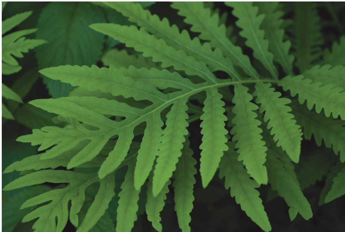
Asa Gray listed sensitive fern ( Onoclea sensibilis ) as a disjunct species, but it was later determined simply to be a very globally widespread species.