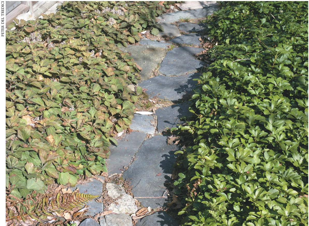
PETER DEL TREDICI

Recognition of the disjunction began in the 1750s with botanists making lists of species found in both regions. By the mid-1800s botanists had collected enough materials to lead them to the astounding conclusion that the flora of eastern North America (ENA) had more in common with eastern Asia (EA) than it did with western North America. Most of